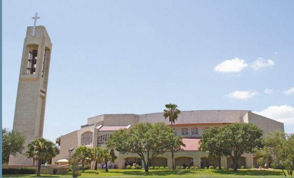
Basilica of Our Lady of San Juan del Valle National Shrine